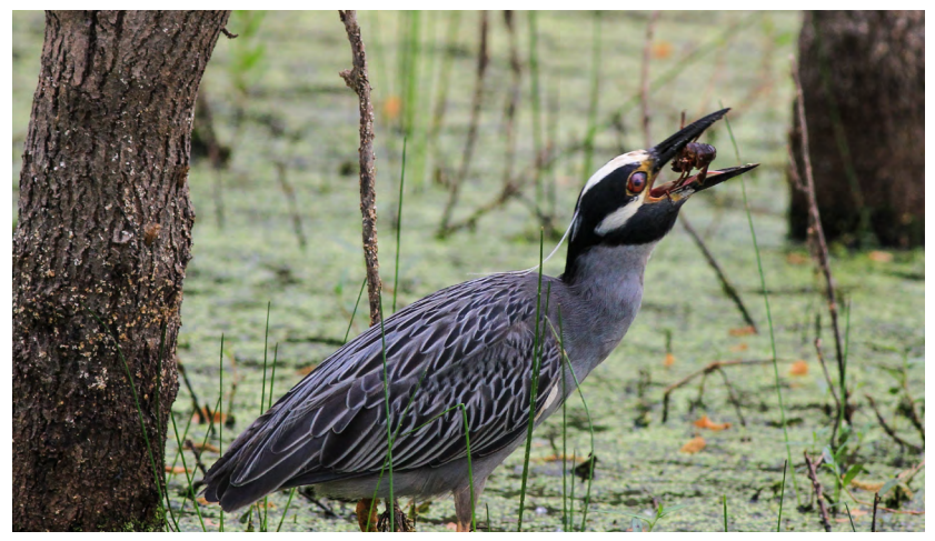
A yellow-crowned night heron enjoys a crawfish dinner in the Atchafalaya Basin. The 1.4-million acre system is home to more than 400 species of animals and plants.