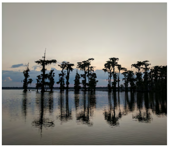
Beautiful and unique, the cypress-tupelo swamps in The Nature Conservancy's Atchafalaya Basin Preserve are yielding insights that could help guide restoration of historic flows and habitats.

Slow, meandering creeks called bayous were slashed by shipping channels and pipeline canals, their high berms ensuring that only water nearing the flood stage could even reach the swamps or drain out of them. Vast areas stagnated, turning bayous that once flowed brown with turbulent, aerated water into slack, black backwaters.