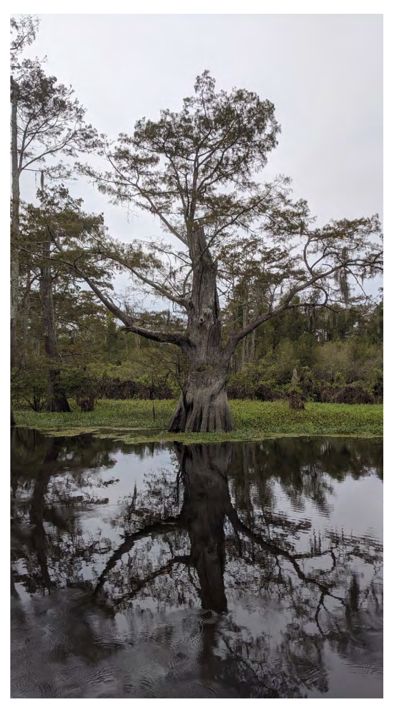
The cypress-tupelo swamps of The Nature Conservancy's Atchafalaya Basin Preserve can serve as spawning grounds, sediment and nutrient filters, and buffers against storm flows from the Gulf.