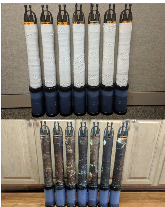
Biofouling is a constant challenge in the Atchafalaya Basin. While the automatic wiper on their EXO2 sondes keep sensors clean through long deployments, Joe Baustian and his team wrap the sondes' bodies in plastic wrap and duct tape to keep them from becoming home to tenacious estuarine life.

Breaking the barriers to seasonal water movement will allow oxygenated, flowing water to deliver a breath of fresh air to fish and crawfish in their muddy beds. It will allow cypress forests–just inches higher in elevation–to drain for a few months so seedlings can take root and rejuvenate native stands.