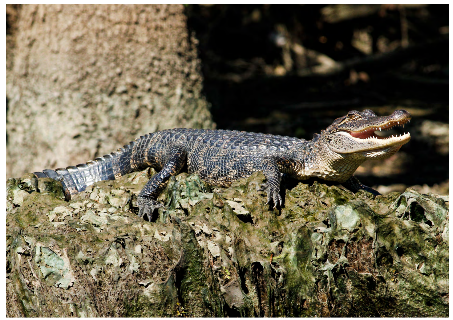
Deep mud, hidden roots, and mosquitoes-and alligators-have kept most scientists from studying the inland swamp forests of the Atchafalaya.