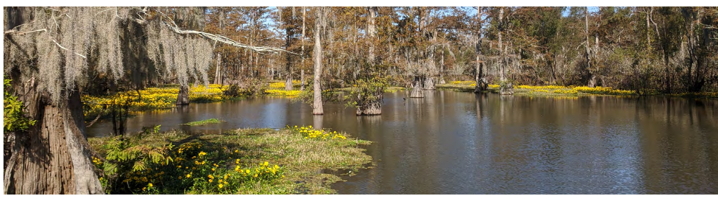
The Nature Conservancy is conducting groundbreaking research in the swamp forests of Louisiana's Atchafalaya Basin–and inadvertently put its EXO2 sondes through an extreme field test when record floods extended their deployment to eight months.